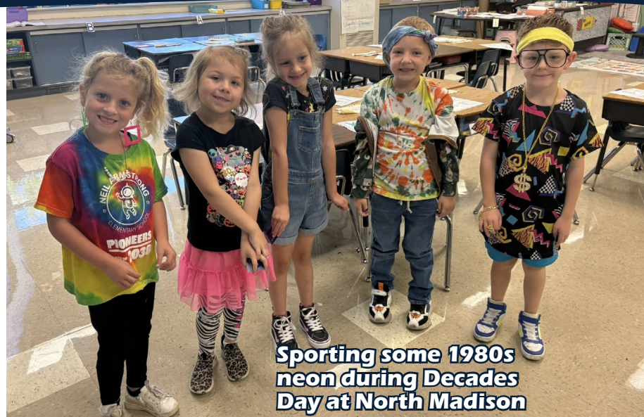
Sporting some 1980s neon during Decades Day at North Madison