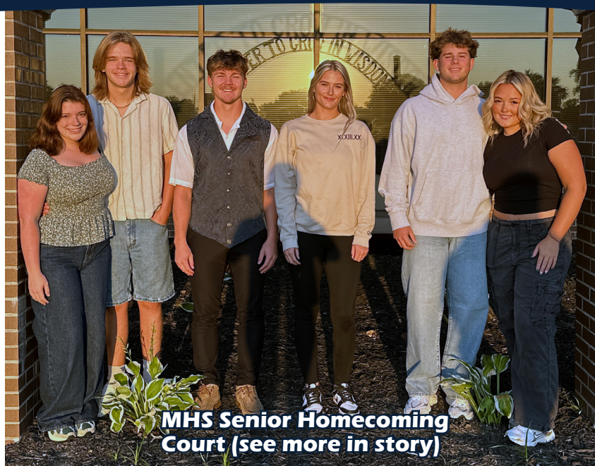
MHS Senior Homecoming Court (see more in story)