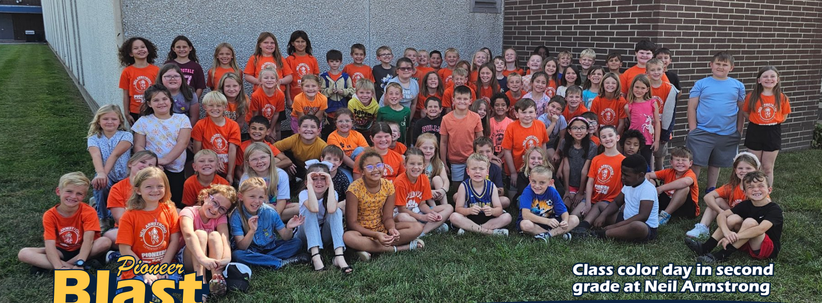
Class color day in second grade at Neil Armstrong