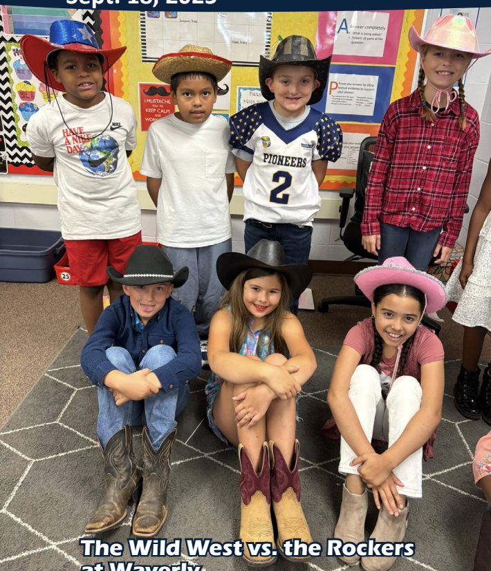
The Wild West vs. the Rockers at Waverly